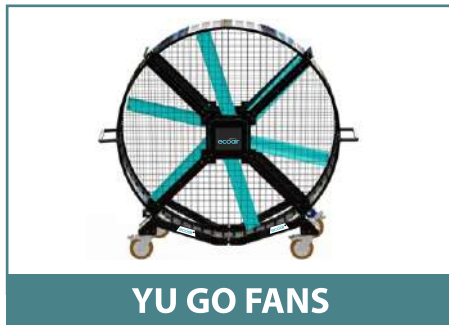
YU GO FANS