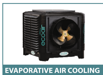
EVAPORATIVE AIR COOLING