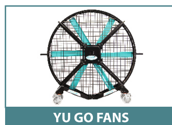
YU GO FANS