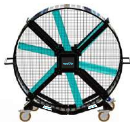
YU GO FANS