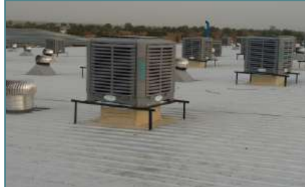
EVAPORATIVE AIR COOLING